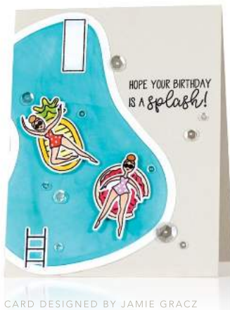
CARD DESIGNED BY JAMIE GRACZ