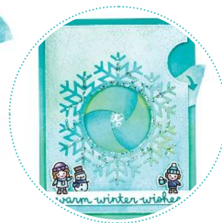
JENN'S CARD FEATURES THE LAWN FAWN MAGIC IRIS DIE

FOR HER CARD: Jenn used the following ink colours: Distress Inks and Distress Oxides in Cracked Pistachio, Peacock Feathers, and Salvaged Patina, and additional Distress Inks in Blueprint Sketch, Hickory Smoke, Spun Sugar, Vintage Photo, Wilted Violet, and Worn Lipstick.