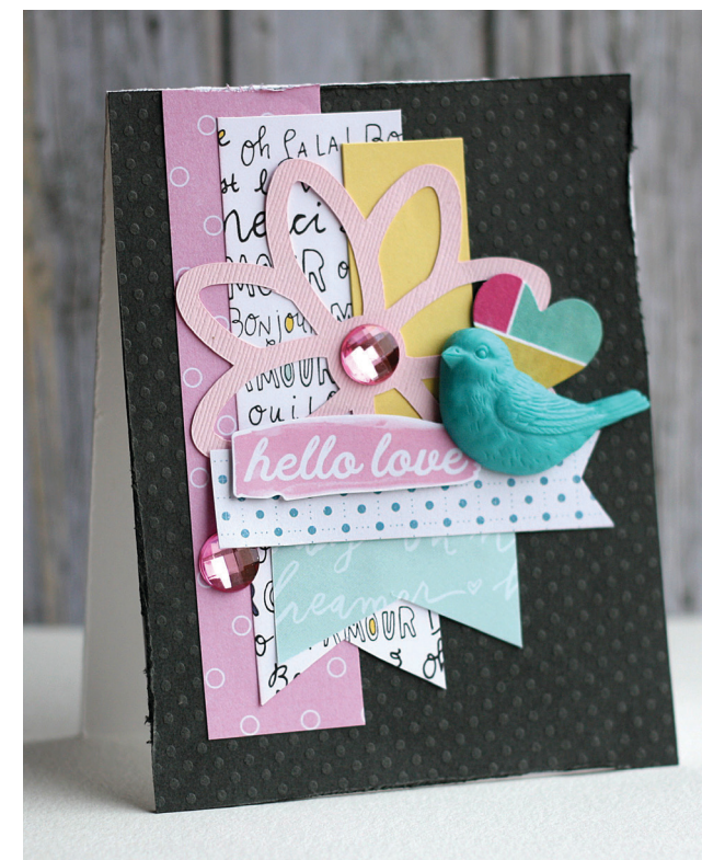
HELLO LOVE CARD