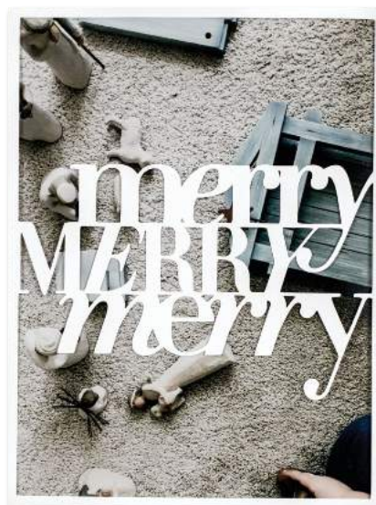
6 x 8 ALBUM PAGES

supplies CARDSTOCK: Neenah; VELLUM: Strathmore Artist Papers; PATTERNED PAPER, STAMP, INK, DIGITAL STAMPS: Ali Edwards; CHIPBOARD: Studio Calico; WOOD VENEER: Studio Calico, Ali Edwards; TABS: Avery; ELECTRONIC CUT FILES: Ali Edwards, One Little Bird; FONT: Rough Typewriter; ADHESIVE: 3M