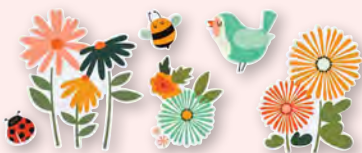
Full Bloom Floral Bits Ephemera by Simple Stories simplestories.com