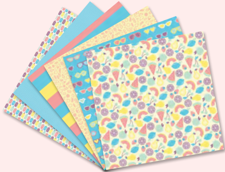
Tutti Fruitti patterned papers by Close To My Heart closetomyheart.com