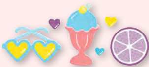
Tutti Fruitti sticker sheet by Close To My Heart closetomyheart.com