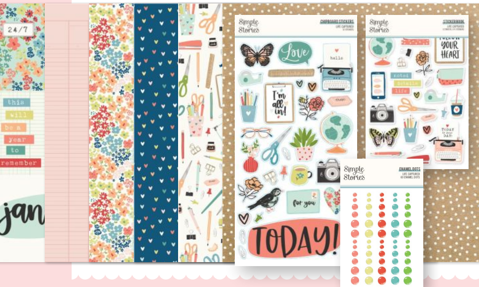
CARD DESIGN BY ANGIE HUNT