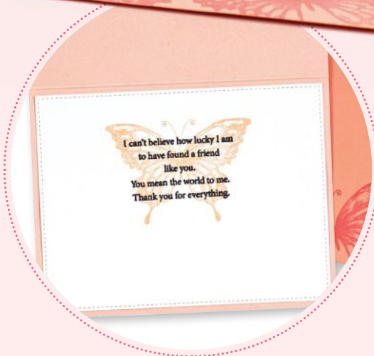
INSIDE THE CARD

DESIGN TIP: Stamp the repeated image in a lighter ink with the sentiment stamped in black on top of it. This adds depth and beautiful interest!