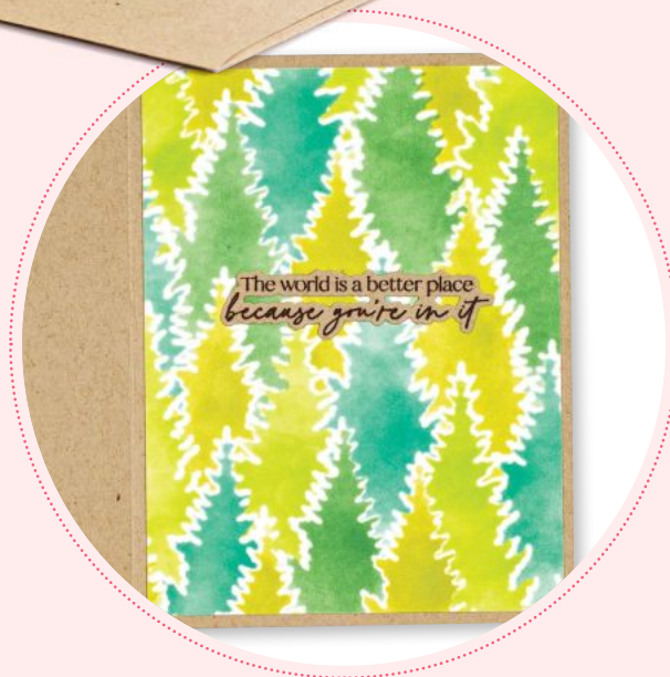
INSIDE THE CARD

DESIGN TIP: Stencil the white cardstock panel for the card front, and without reinking, stencil on a second panel of white cardstock for a lighter impression. A softer stencil pattern on the inside makes it easier to write a message.