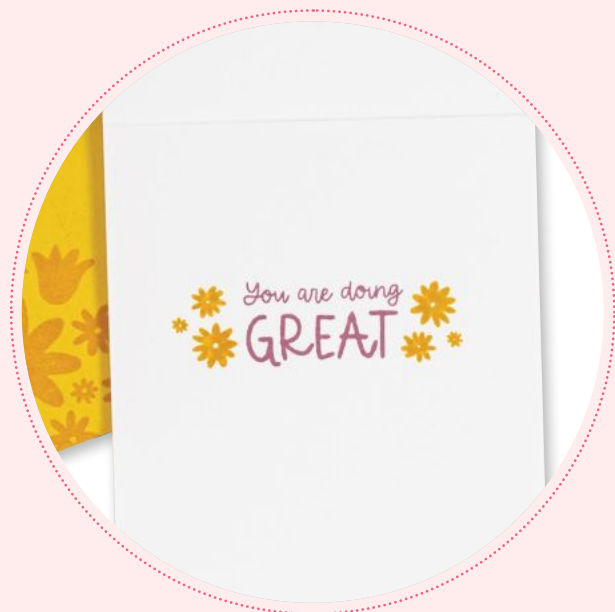
INSIDE THE CARD

supplies CARDSTOCK, STAMPS, INK, DIES: Concord & 9th; ENVELOPE: Paper Source; ADHESIVE: Gina K. Designs, Scrapbook Adhesives by 3L