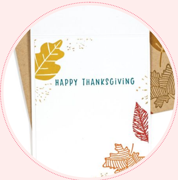
INSIDE THE CARD

DESIGN TIP: Carry the heat embossing and tone-on-tone stamping onto all parts of the card and envelope suite for a beautiful theme.