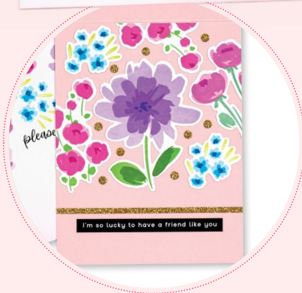
INSIDE THE CARD

DESIGN TIP: Use a stamp and stick mat and place a negative from the die cuts as a template to stamp all similar images so you don't have to reposition the stamp after each impression.